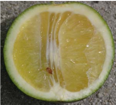
Lopsided bitter, hard fruit with small dark aborted seeds