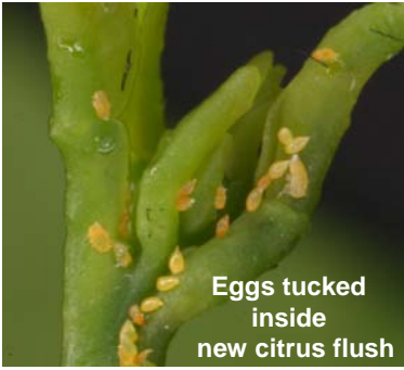
Eggs tucked inside new citrus flush