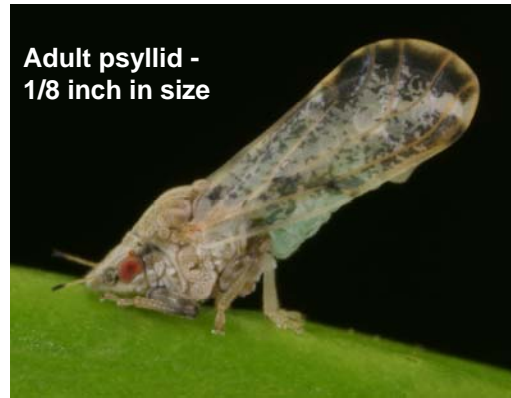
Adult psyllid - 1/8 inch in size