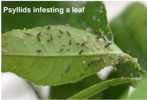
Psyllids infesting a leaf