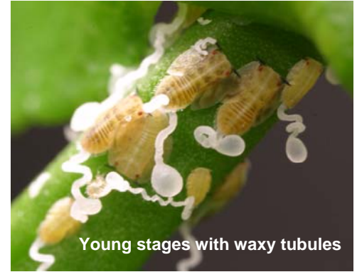
Young stages with waxy tubules